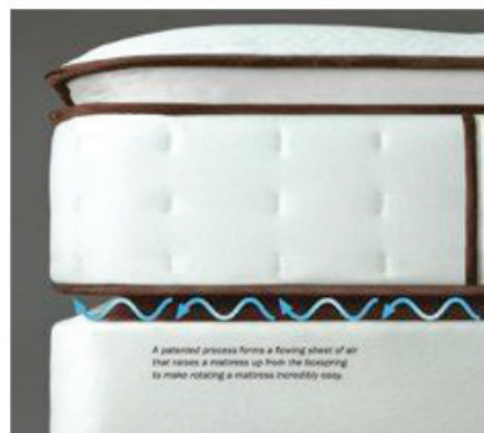
A patented process forms a floating sheet of air that raises a mattress up from the floor, making rotating a mattress incredibly easy.

The interest level and marketing opportunities that the UpLift and GlideOn lines offer to retailers is apparent. This system immediately overcomes many potential consumers' hesitations about purchasing a deeper or heavier premium or luxury mattress.